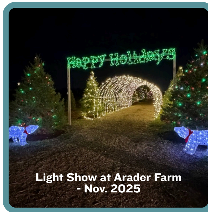
Light Show at Arader Farm - Nov. 2025