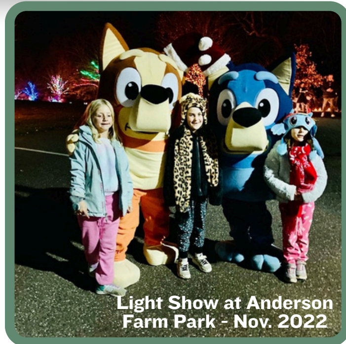
Light Show at Anderson Farm Park - Nov. 2022

Be sure to mark your calendar & join us for this annual tradition at Arader Farm . This year our special guests include Holiday Mickey and Minnie, Santa, and Buddy the Elf! Our special visitors will be stopping by on select nights so be sure to keep an eye out on our social media pages this fall! We encourage you to make a whole night of it by visiting the store, checking out the model train inside, and walking through the light show while sipping hot chocolate. Stay tuned for ticket information on Arader Farm's website in the near future. Tickets are required to enter the light show and to see all characters. Tickets for the light show are available for purchase on Arader Farm's website or at the store.