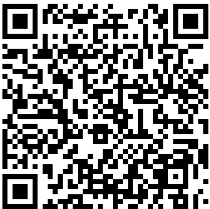
March 2026 Open Gym & GEX Calendar