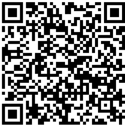
March 2026 Programs & Events Calendar